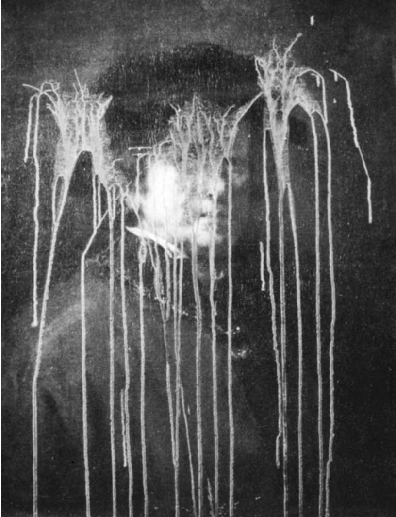
Figure 5. Rembrandt, Self-Portrait , damaged by acid in 1977

how the presence of disability requires us to revise traditional conceptions of aesthetic production and appreciation, and here the examples of two remarkable artists, Paul McCarthy and Judith Scott, make a good beginning because they are especially illuminating and suggestive.