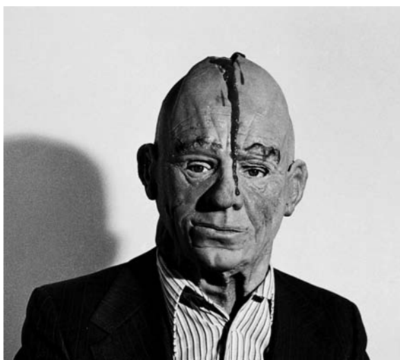
Figure 7. Paul McCarthy, Hollywood Halloween , 1977, performance

disabled. The video of Class Fool (1976), for example, shows the audience's reaction to his performance, moving from amusement, to hesitation, to aversion. At some level, McCarthy's commitment to elemental behavior—smearing himself with food, repeating meaningless actions until they are ritualized, fondling himself in public—asks to be seen as idiocy, as if the core values of intelligence and genius were being systematically removed from the aesthetic in preference to stupidity and cognitive disorder. Plaster