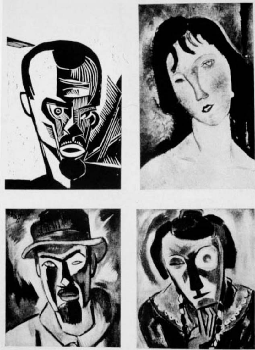
Figure 3. “Degenerate” art by Karl Schmidt-Rottluff and Amedeo Modigliani, from Paul Schultze-Naumburg, Kunst und Rasse , 1928