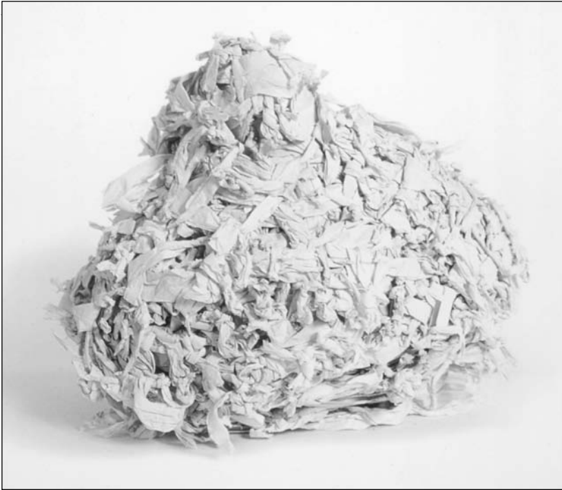
Figure 10. Judith Scott, untitled, no date, Creative Growth Center