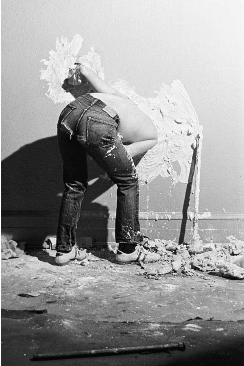
Figure 8. Paul McCarthy, Plaster Your Head and One Arm into a Wall , 1973, performance