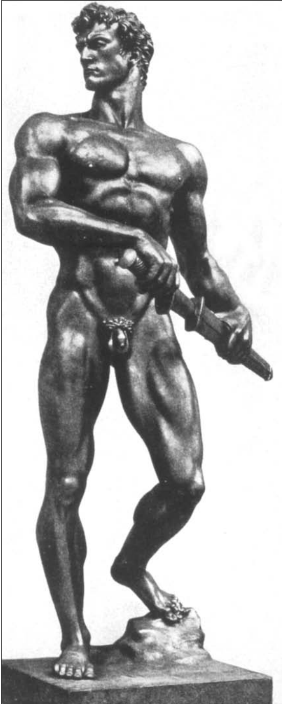
Figure 2. Arno Breker, Readiness , 1937, Great German Art Exhibition, 1937