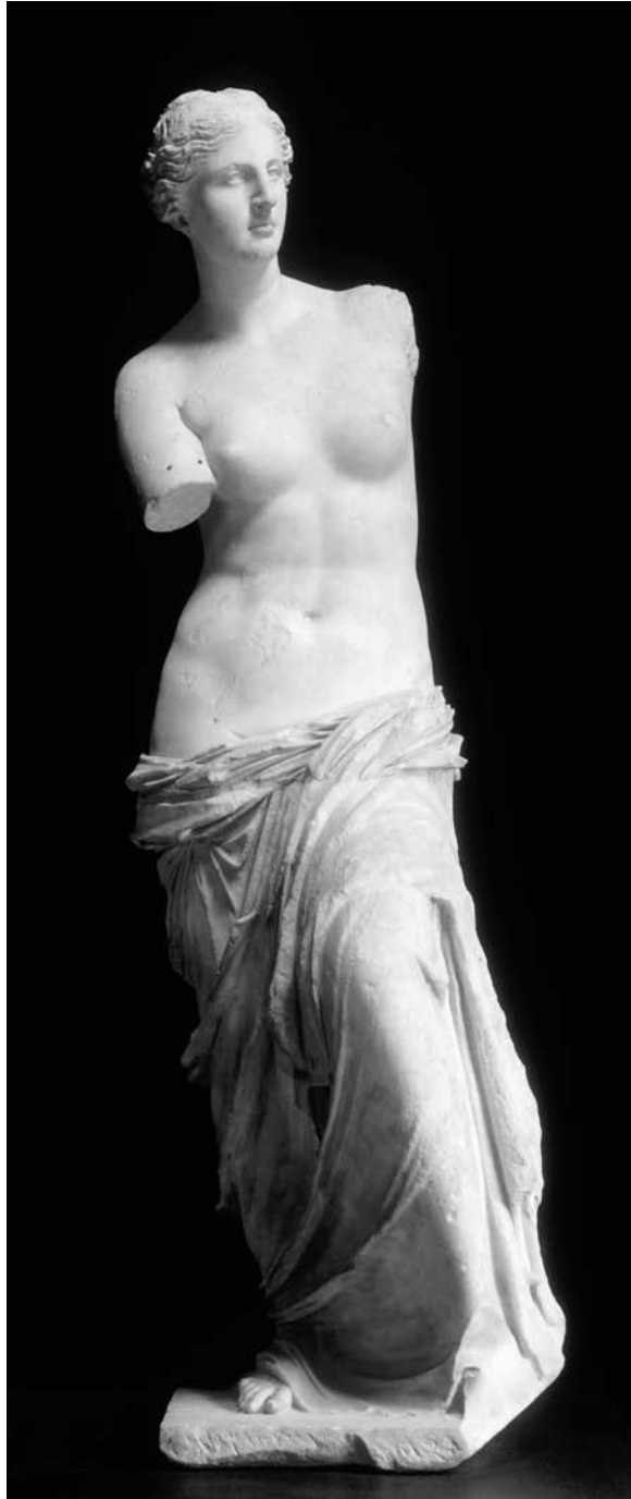
Figure 1. Venus de Milo, 100 BCE, Paris, Louvre